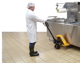
Easily moved with a pallet jack or forklift