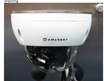
EWON internet connectivity ties PLC, touch screen and cameras to UltraSource for field support