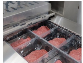
Hygienic rollers are slotted to allow easy wash down draining