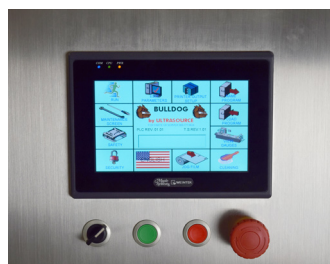
Simple touch screen operation. All safety and operation functions are built into touch screen