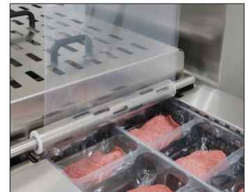
Hygienic rollers are slotted to allow easy washdown and draining.