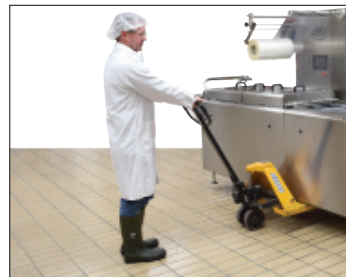
Easily moved with a pallet jack or forklift.