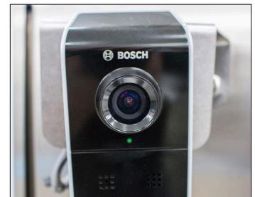
EWON internet connectivity ties PLC, touchscreen and cameras to UltraSource for field support.