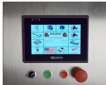
Simple touchscreen operation. All safety and operation functions are built into the touchscreen.